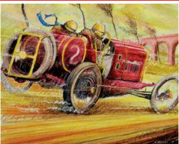
NOSTALGIE DU CIRCUIT DE DIEPPE

Dieppe circuit's nostalgia , vintage cars exhibition & parade will take place on 2 nd and 3 rd September in Dieppe (Seine-Maritime). The cars will follow the historic 1907's race route and will stay for a static display in le château d'EU. More info on: http://diepperetro.pagesperso-orange.fr/ Rétro-Nautic is an event dedicated to vintage dinghies and keelboats on 23 rd & 24 th September in Ouistreham (Calvados). Info on www.normandie.fr/retro-nautic .